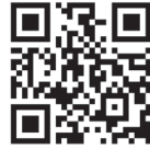
Drama Department Facebook